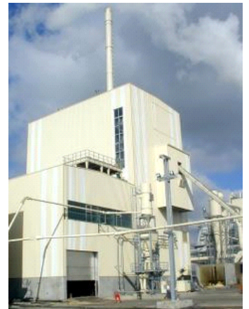
The Swiss Krono CHP plant produces 20MWe and 10 MW process heat.