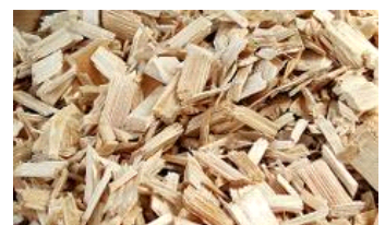
The SODC cogeneration plant uses wood from forestry, residues from sawmills and clean, recycled wood.