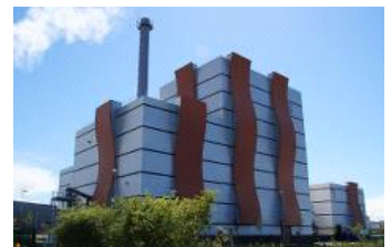
The biomass-fired CHP plant in Orléans was commissioned in 2015.

Boiler: 37 MW th 122 bara 525 °C Electrical power: ≤8 MW e Process energy: ≤25 MW th