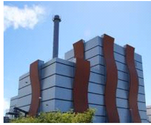
The SODC Orléans cogeneration plant supplies district heating to 15,000 homes, equivalent to 27% of the city of Orléans.