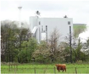
Rothes CoRDe Ltd is a biomass-fired cogeneration plant in Scotland fuelled by a whisky by-product and clean wood.