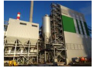
The Biolaq Energies project, in Lacq, is a biomass-fired CHP plant of 54 MW, that utilises forestry wood, and clean, uncontaminated residues from wood processing.