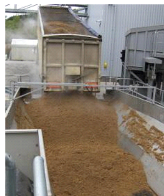
The plant utilises draff which is a by-product of whisky production. This comes from 17 different distilleries and is mixed 50/50 with wood chips.