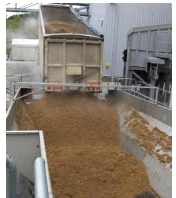
The plant utilises draff which is a by-product of whisky production. This comes from 17 different distilleries and is mixed 50/50 with wood chips.