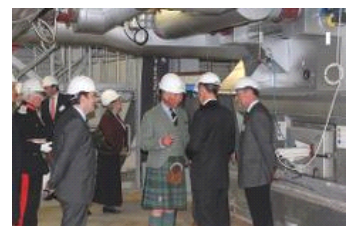
On 16th April 2013, HRH The Prince Charles, Duke of Rothesay, officially opened the Rothes CoRDe 8.3 MWe biomass fired combined heat and power plant at Rothes, Morayshire, Scotland.