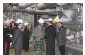
On 16th April 2013, HRH The Prince Charles, Duke of Rothesay, officially opened the Rothes CoRDe 8.3 MWe biomass fired combined heat and power plant at Rothes, Morayshire, Scotland.