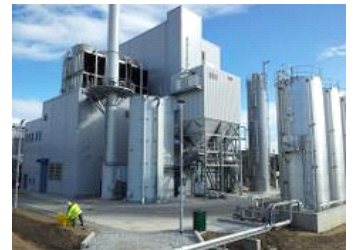
The Rothes CoRDe cogeneration plant produces heat and power.

Boiler: 34 MW fuel heat input 80 bara 450°C Electrical: 8,3 MW e Process energy: 8,0 MW thermal