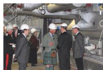
On 16th April 2013, HRH The Prince Charles, Duke of Rothesay, officially opened the Rothes CoRDe 8.3 MWe biomass fired combined heat and power plant at Rothes, Morayshire, Scotland.