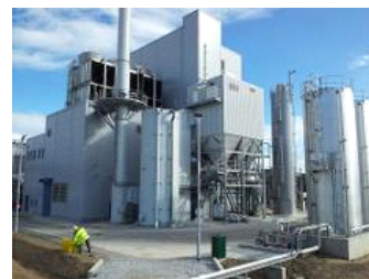
The Rothes CoRDe cogeneration plant produces heat and power.

Boiler: 34 MW fuel heat input 80 bara 450°C Electrical: 8,3 MW e Process energy: 8,0 MW thermal