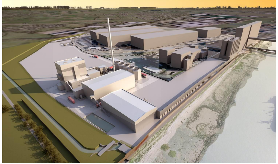
A 3D illustration of the Tilbury Green Power Plant